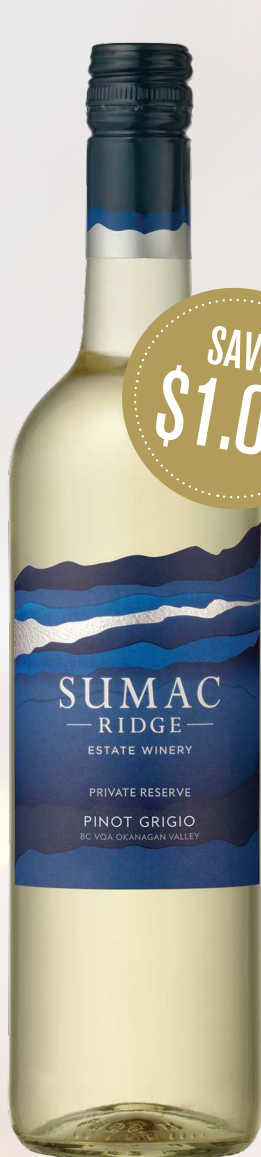
Sumac Ridge Private Reserve Pinot Grigio