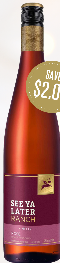
See Ya Later Ranch Nelly