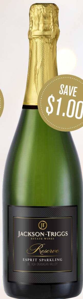
Jackson-Triggs ESPRIT Sparkling