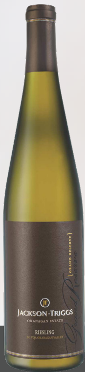
Jackson-Triggs Grand Reserve Riesling