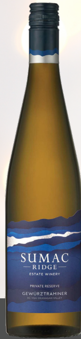
SUMAC RIDGE PRIVATE RESERVE GEWURZTRAMINER