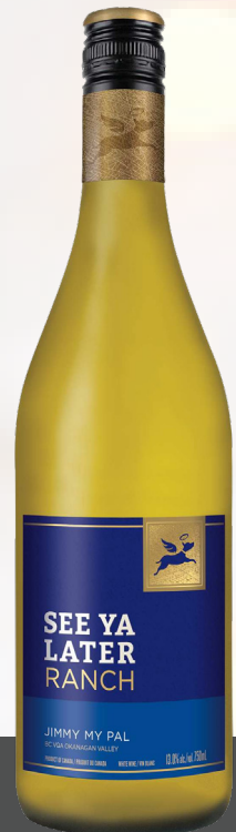
See Ya Later Ranch Jimmy My Pal

Free organza bag with purchase of any of these great wines!*