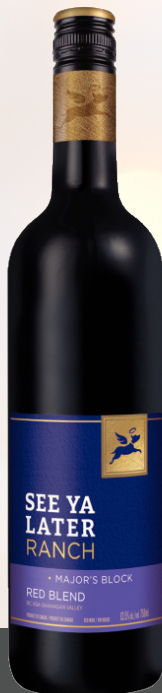
SEE YA LATER RANCH MAJOR'S BLOCK