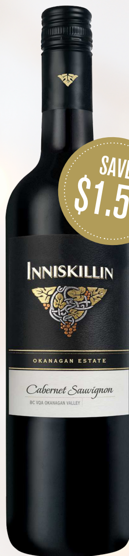
Inniskillin Okanagan Estate Series Cabernet Sauvignon