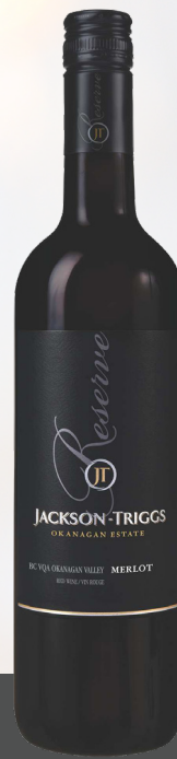
JACKSON-TRIGGS RESERVE MERLOT