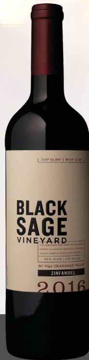
Black Sage Vineyard Zinfandel