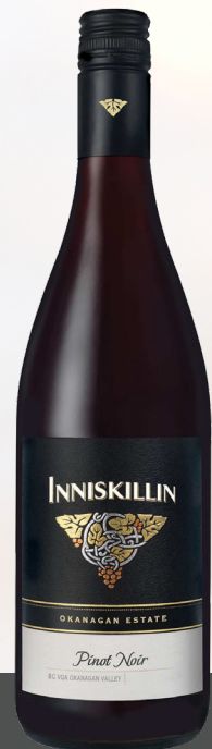
INNISKILLIN OKANAGAN ESTATE SERIES PINOT NOIR