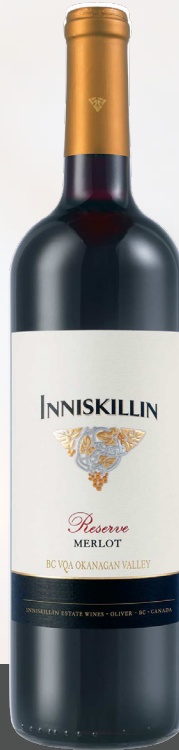
Inniskillin Okanagan Reserve Merlot