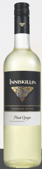
INNISKILLIN OKANAGAN ESTATE SERIES PINOT GRIGIO