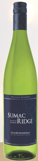
SUMAC RIDGE PRIVATE RESERVE GEWURZTRAMINER