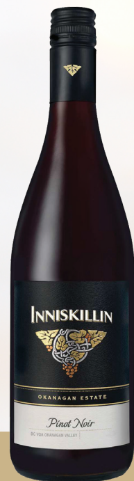
INNISKILLIN OKANAGAN ESTATE SERIES PINOT NOIR