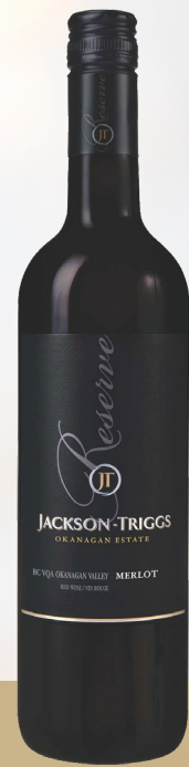
JACKSON-TRIGGS RESERVE MERLOT