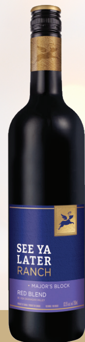
SEE YA LATER RANCH MAJOR'S BLOCK