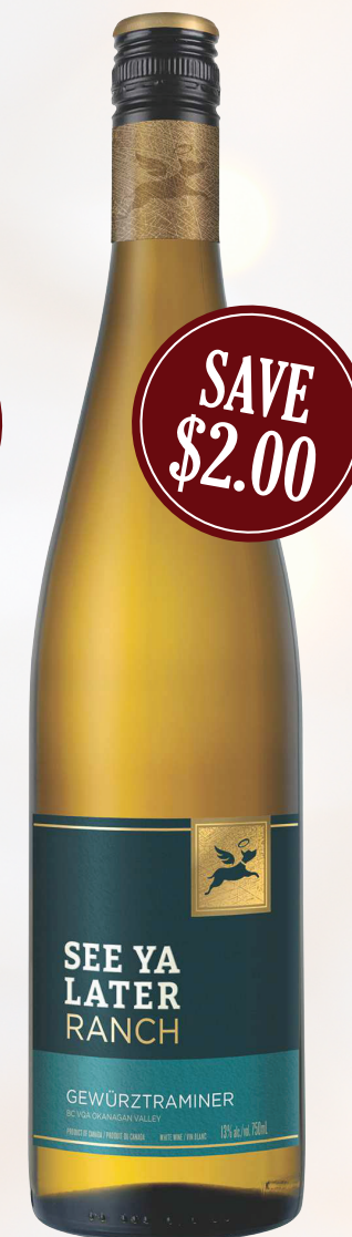
See Ya Later Ranch Gewurztraminer