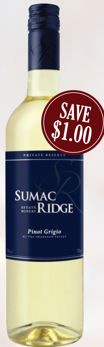
Sumac Ridge Private Reserve Pinot Grigio