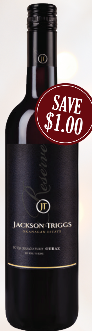
Jackson-Triggs Reserve Shiraz