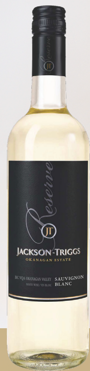
Jackson-Triggs Reserve Sauvignon Blanc