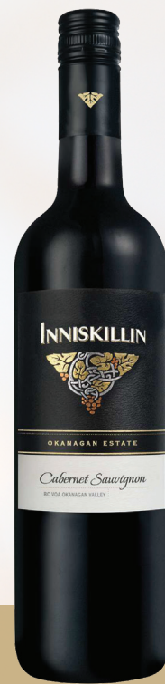
Inniskillin Okanagan Estate Series Cabernet Sauvignon