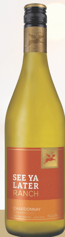
See Ya Later Ranch Chardonnay