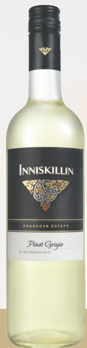
INNISKILLIN OKANAGAN ESTATE SERIES PINOT GRIGIO