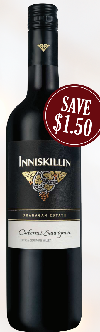
Inniskillin Okanagan Estate Series Cabernet Sauvignon